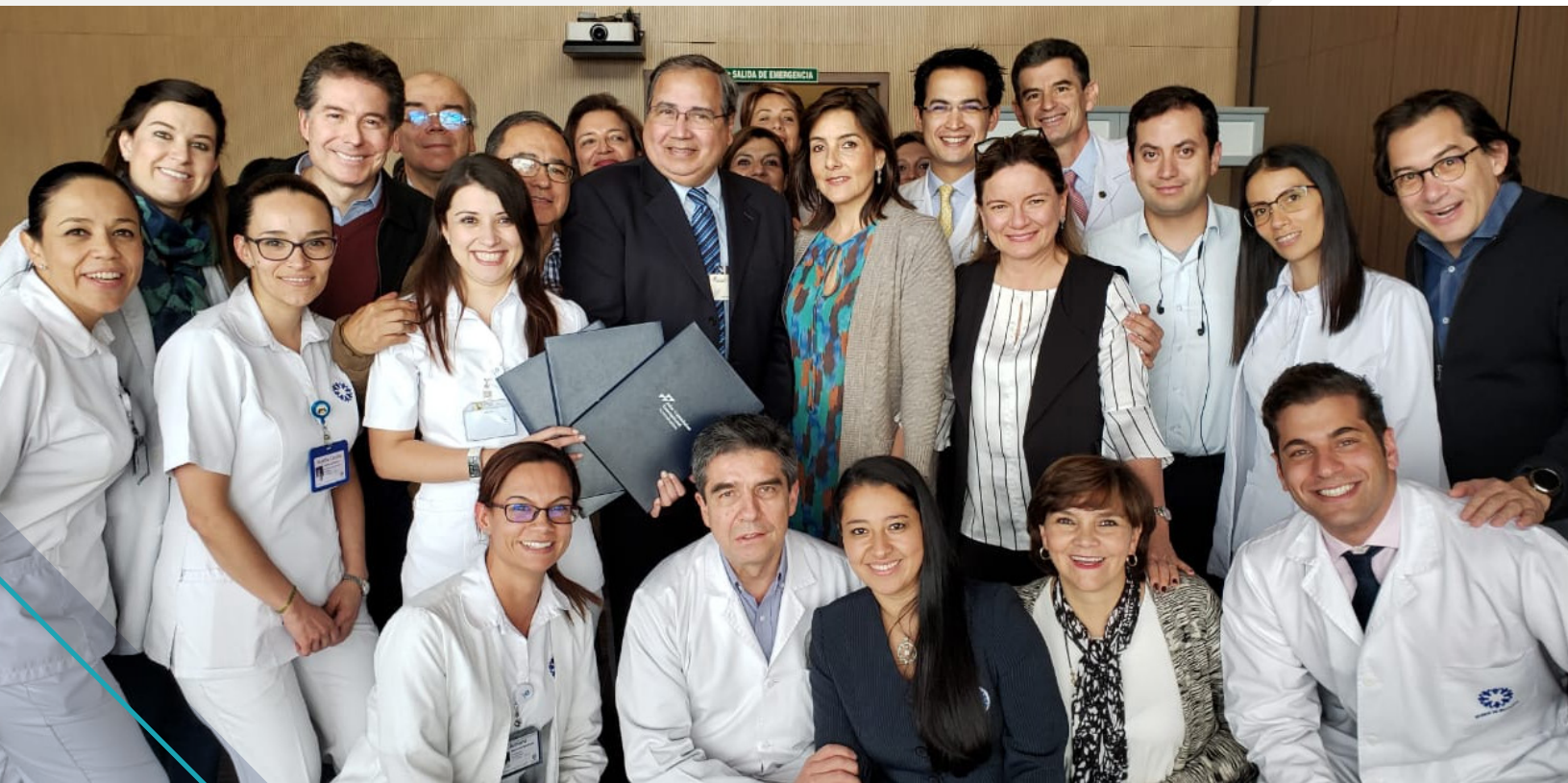
FSFB team celebrates completion of their survey process with the JCI surveyor.